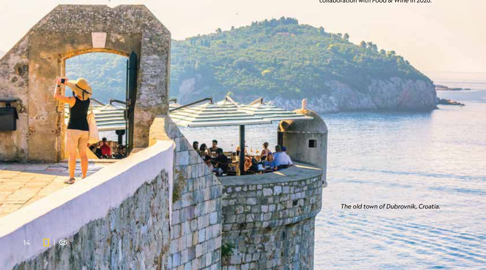
The old town of Dubrovnik, Croatia.

This itinerary is part of a unique wine collaboration with Food & Wine in 2026.