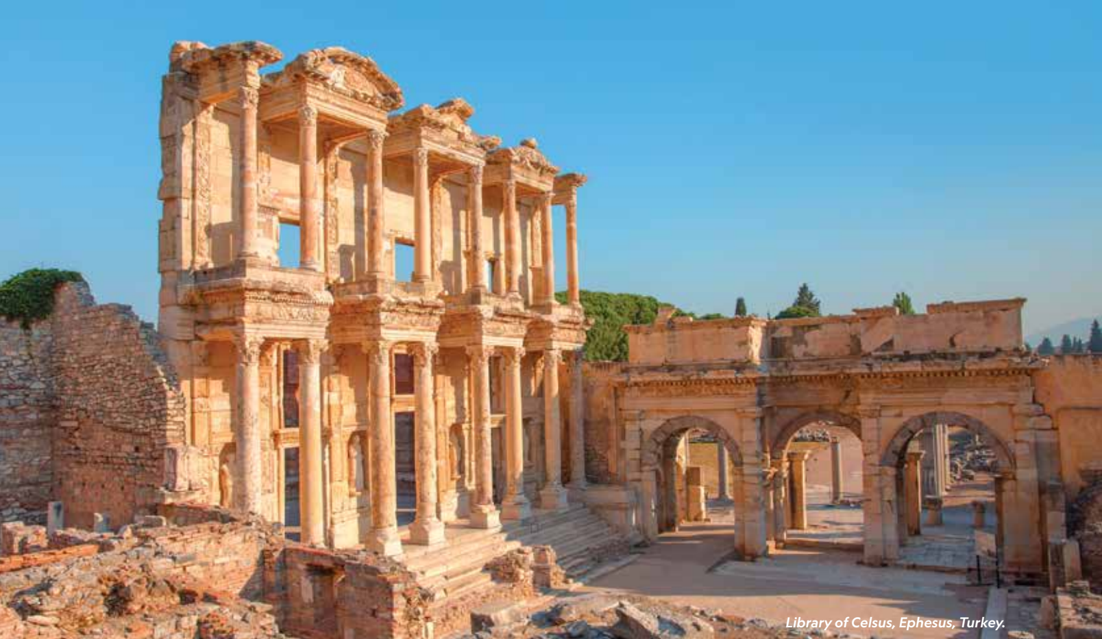
Library of Celsus, Ephesus, Turkey.