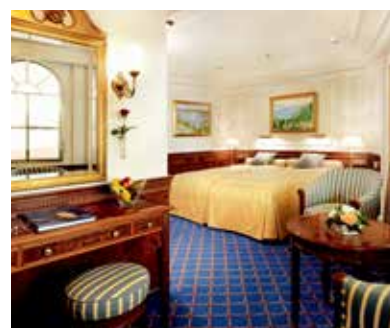
Clockwise from top: The lounge offers the perfect setting to relax; Category 4 cabin; Category 7 cabin.