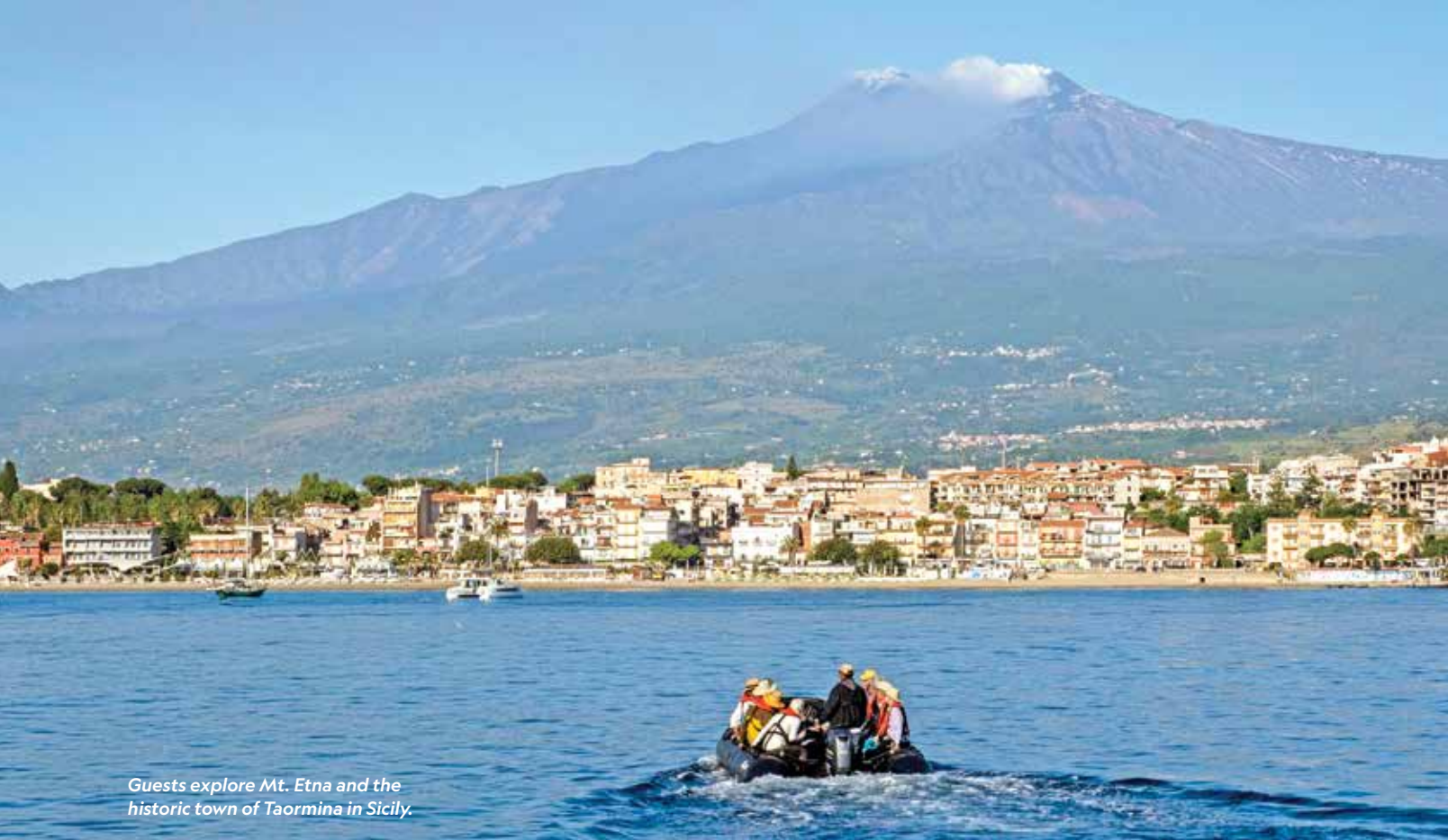
Guests explore Mt. Etna and the historic town of Taormina in Sicily.