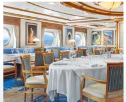
Clockwise from top: Category 5 stateroom; dining room; cabin bathroom.