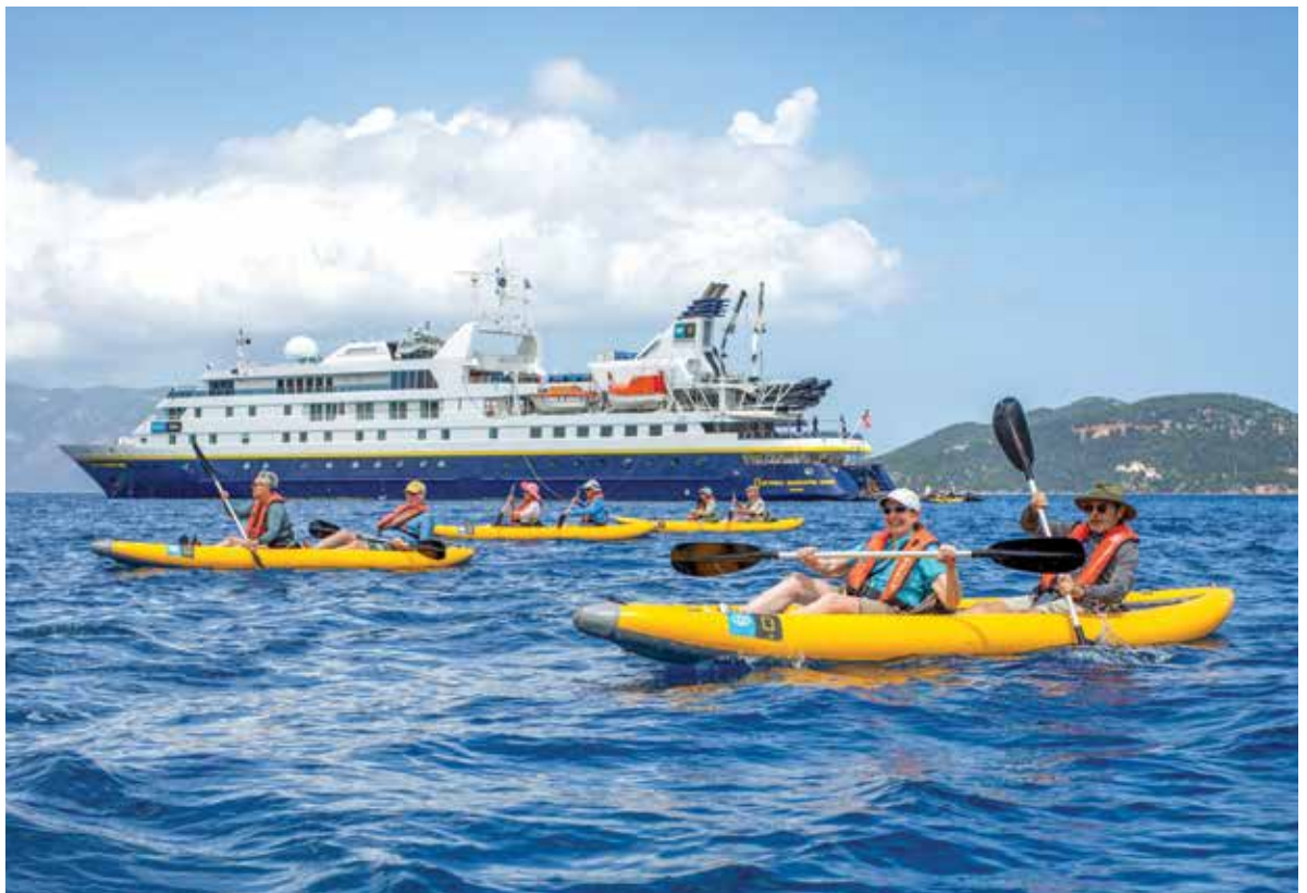
Clockwise from left: A local chef prepares a traditional Croatian peka at a cooking class in Dubrovnik; a mesmerizing whirling dervish performance in Kuşadası, on Turkey's sparkling Aegean coast; a market in Croatia brims with fresh flavors and local color; guests enjoy kayaking off the coast of Kefalonia.