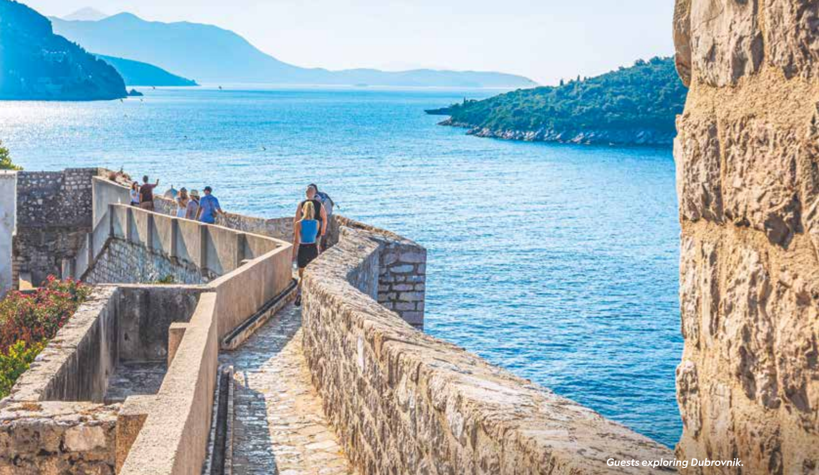
Guests exploring Dubrovnik.